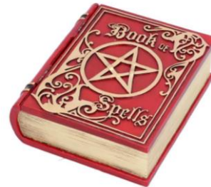
Book of spells