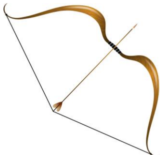
Bow and Arrow